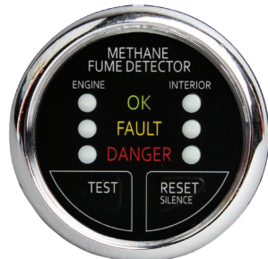
S2CR-M-ECU-X 12/24 VDC 2 in. (56 mm) Dia. Chrome Round Bezel Two Sensors