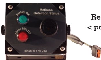
Remote < panels