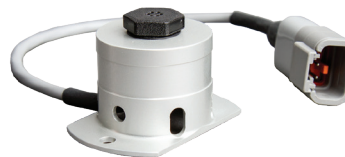
MS-7 / MS-9 (Status LED) Anodized Aluminum Sensor Current Draw @ 12 VDC: 30 mA Operating Temperature: -40°F to 221°F (-40°C to 105°C)