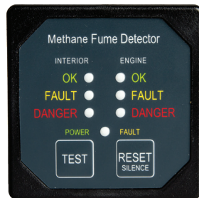
S2B-M-X3-Display 12/24 VDC 2-5/8 in. (76 mm) Square Black Square Bezel Three Sensors – Sensor Identified by "Internal" LED sequence