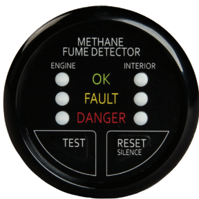
S2BR-M-ECU-X 12/24 VDC 2 in. (56 mm) Dia. Black Round Bezel Two Sensors