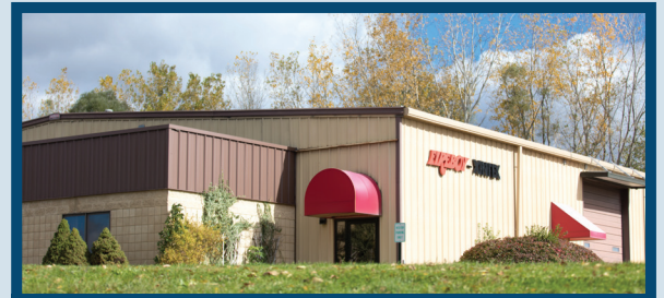
Grand Rapids, Michigan, USA

The quality manufactured into each of our products means selecting Fireboy-Xintex is selecting peace of mind for your business.