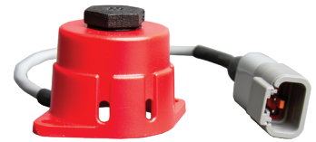
MS-8 / MS-10 (Status LED) PC/ABS Thermoplastic Sensor Current Draw @ 12 VDC: 30 mA Operating Temperature: -40°F to 185°F (-40°C to 85°C)